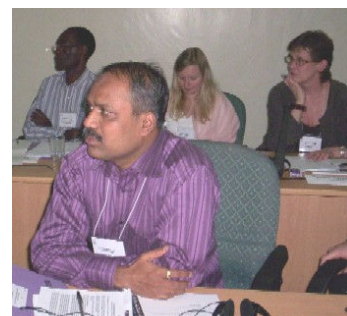
Chief at ACT Development Assembly

ACT (Action by Churches Together) Development, the new global alliance for development, celebrated its first assembly on February 5-7 in Nairobi, Kenya, hosted by the All Africa Conference of Churches. By working collaboratively, the alliance aims to increase the effectiveness of ecumenical work on poverty, injustice and human rights abuse. The alliance brings together 55 ecumenical organizations and churches. The Assembly considered the future direction of the alliance as well as its mechanisms and programmatic activities. It was agreed by the Assembly that ACT Development should continue discussions with ACT International, the churches global alliance for emergency response, to explore possibilities of a structural relationship between the two alliances. A close working relationship will also be maintained with the Ecumenical Advocacy Alliance.